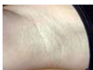
Laser Hair Removal